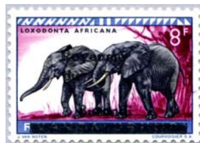
Black op, normal

The 8F Loxodonta Africana (elephant) stamp was overprinted both in black (normal) and blue (error). A number of sheets received the blue overprint and it has attained catalog status. The 1.50F Bubalas (buffalo) stamp was normally overprinted in the blue and some of the 8F stamps were probably overprinted right after them. The overprint is some times hard to see since the obliteration bar barely hides the Ruanda-Urundi inscription.