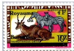
4 mm 'xx'

The value of some of the 10F Hippotigris/Taurotragus oryx (zebra and oryx) stamps was changed to 4F by addition of 4F to the upper right quadrant and marking out of the 10F value with 'XX'. Two variations of the letter 'X' were used, narrow and wide; these are sometimes called small and large. The total width of the two narrow 'X' is 4 mm, while that of the wide 'X' is 6 mm. The fonts used are the same height.