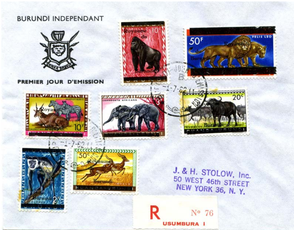
Official First Day Cover from the first set

Both types of the vertical overprint, black and blue overprints on the 8F stamps and narrow and wide bars on the 50F stamp are seen on the first set of FDCs. Private FDCs are known.