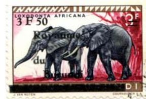
4 mm spacing

The value of some of the 10F Hippotigris/Taurotragus oryx (zebra and oryx) stamps was changed to 4F by addition of 4F to the upper right quadrant and marking out of the 10F value with 'XX'. Two variations of the letter 'X' were used, narrow and wide; these are sometimes called small and large. The total width of the two narrow 'X' is 4 mm, while that of the wide 'X' is 6 mm. The fonts used are the same height.