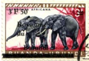
2 mm spacing (normal)