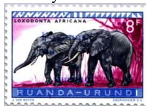
Blue op, error

The 50c and 6.50F Impala stamps both have the same error; Royaume du Royaume rather than Royaume du Burundi . This occurs once per sheet of 100 in the third row. Middle bottom stamp below.