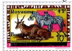
6 mm 'xx'