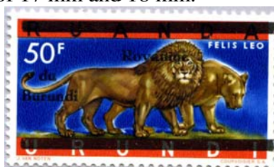
Thin bars (normal)

The setting of the overprint for these larger format stamps has the word Royaume shifted to the right and a second obliteration bar added. Two varieties seen on the 50F Felis Leo (lion), thin and thick obliteration bars. The thin bars are the normal configuration and used on the 20F stamps. The thick bar setting has two variations; spacing between the bars of 17 mm and 18 mm.