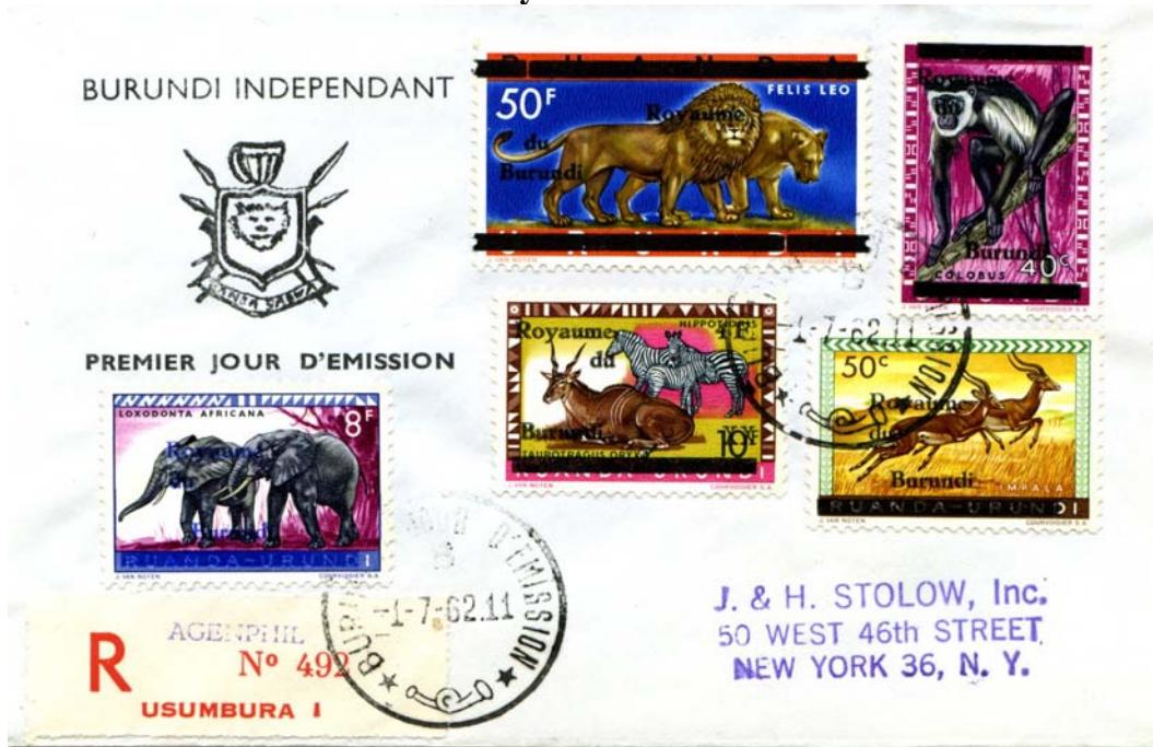
Official First Day Cover from the second set (AGENT PHIL on registration label)